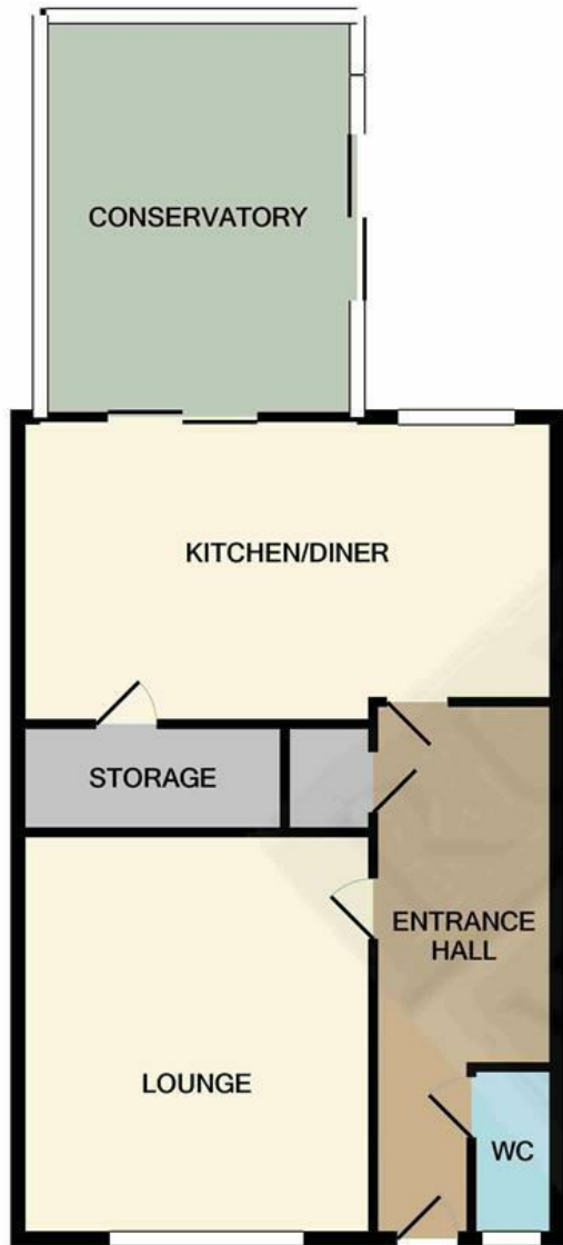
GROUND FLOOR APPROX. FLOOR AREA 609 SQ.FT. (56.6 SQ.M.)